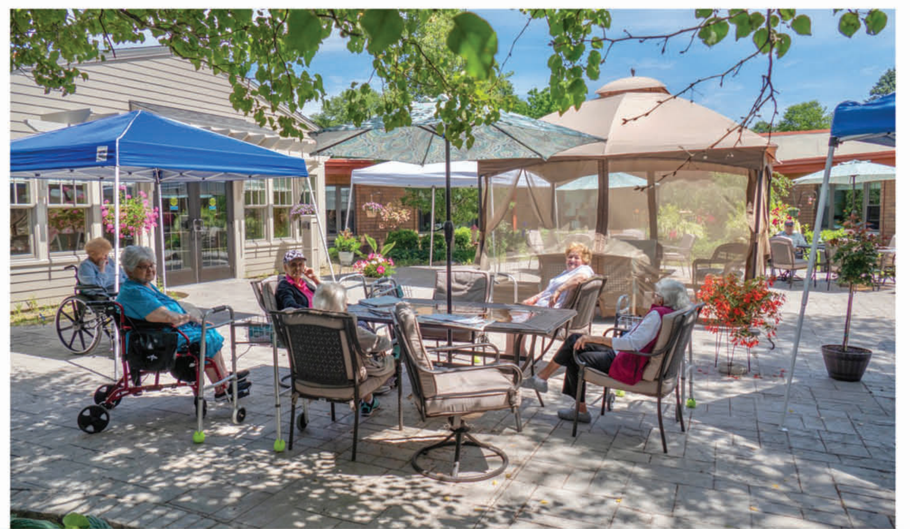
Above – Saint Elizabeth Manor residents and staff are thrilled with the transformation of the main dining room. The light, bright, interior space opens to an equally lovely solarium and new stamped concrete patio.

At Cornerstone’s Memory Care Center, aging kitchen countertops and cabinets have been replaced with beautiful stainless steel, and a durable tiled floor installed. The original wallpaper was removed and the entire center freshly painted from top to bottom, creating a cheery feel within.